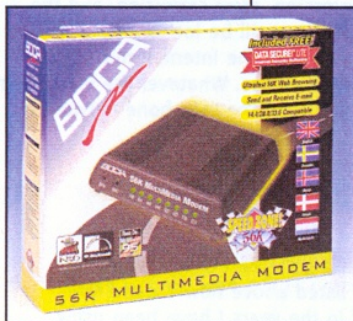
Boca 56K Multimedia Modem