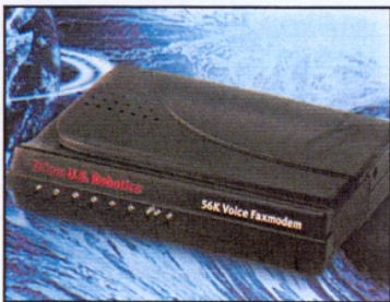
3Com 56K Voice FaxModem -V.90/X2