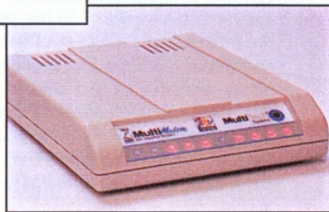
MultiTech MT5600ZDX - V.90