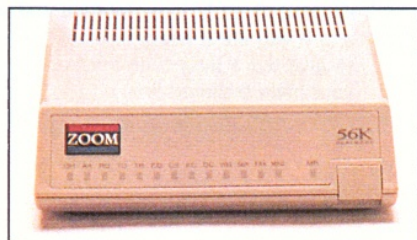
Zoom 56K Dualmode V.90/K56Flex

P redictions put the number of modems to be sold in the years following 2000 at around 75 million per year. The bulk of those will be V.90 modems. It is also predicted that V.90 will be the last speed standard for analogue modems. More on the reasons for that in a moment.