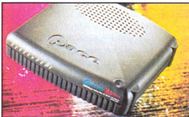
Pace 56 Voice External V.90/K56Flex